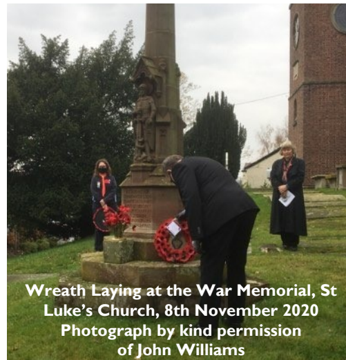
Wreath Laying at the War Memorial, St Luke's Church, 8th November 2020